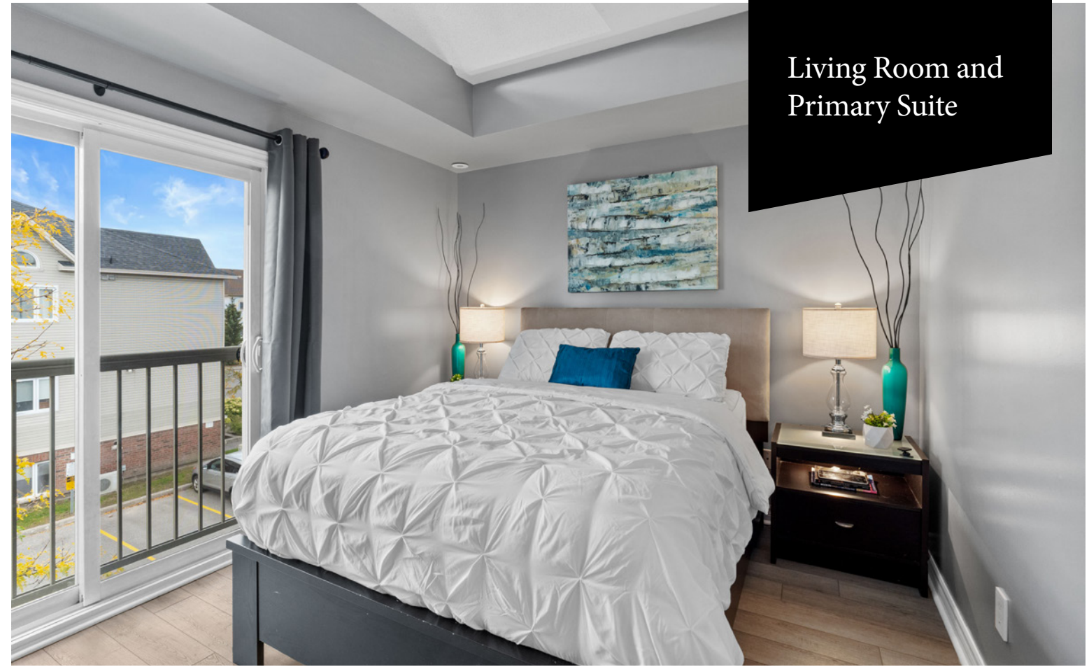
Living Room and Primary Suite